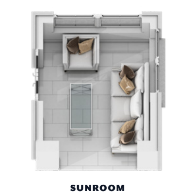
2.8m x 3.2m 9ft 2" x 10ft 5"